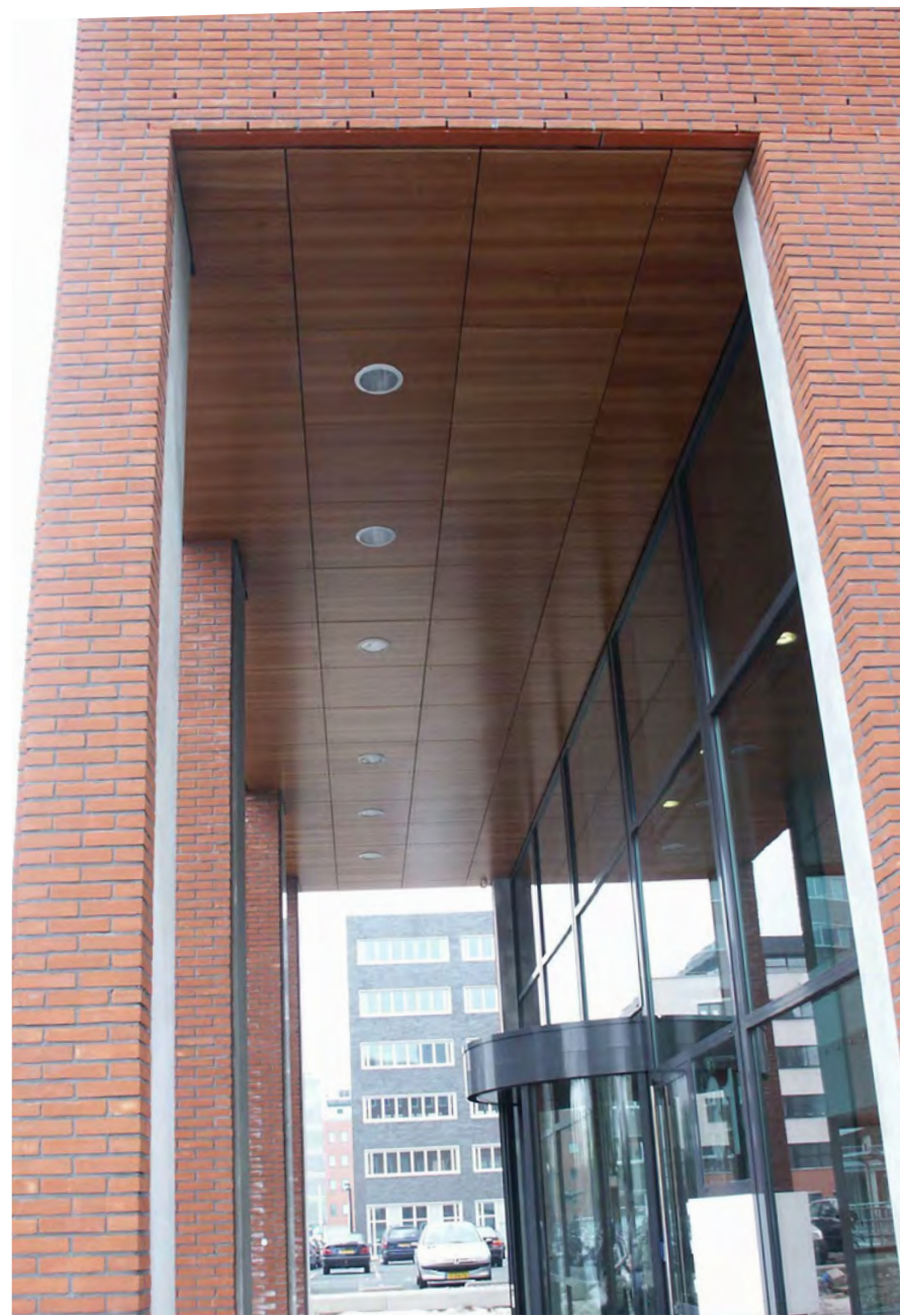
LAWAPAN SYSTEM CEILING PANELS