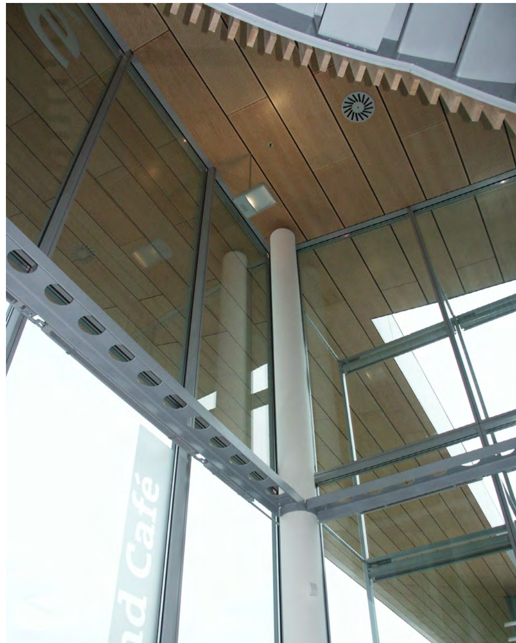
LAWAPAN STANDARD CEILING PANELS: INSTALLED TO BOTH INTERIOR AND EXTERIOR, IN A CONTINUOUS CEILING CONFIGURATION